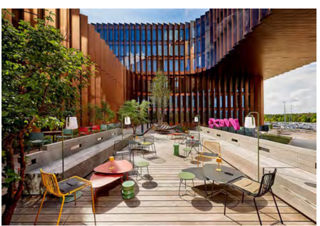
Relax at the green terrace on the first floor of the Moxy Hotel Luxembourg Airport, located within the Skypark Business Center.